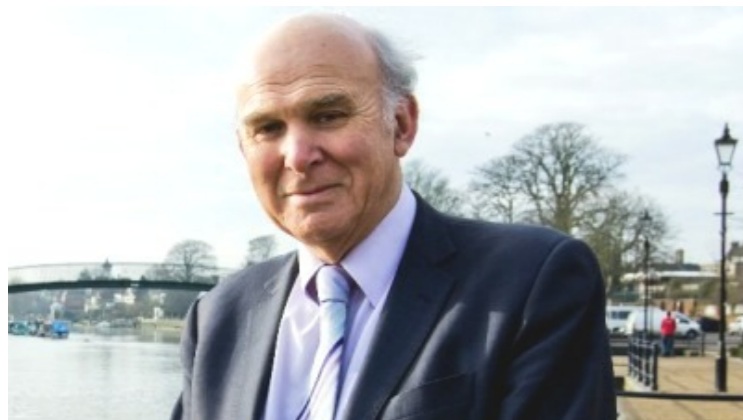
Rt Hon Vince Cable MP, Leader of Liberal Democrats NHS